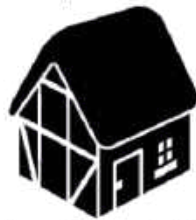
c18th Heather-Thatched Cottages