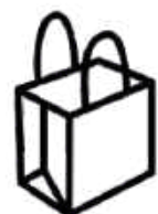
Buy Souvenirs 😊