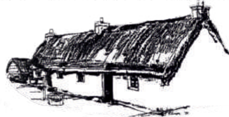
Glencoe Folk Museum